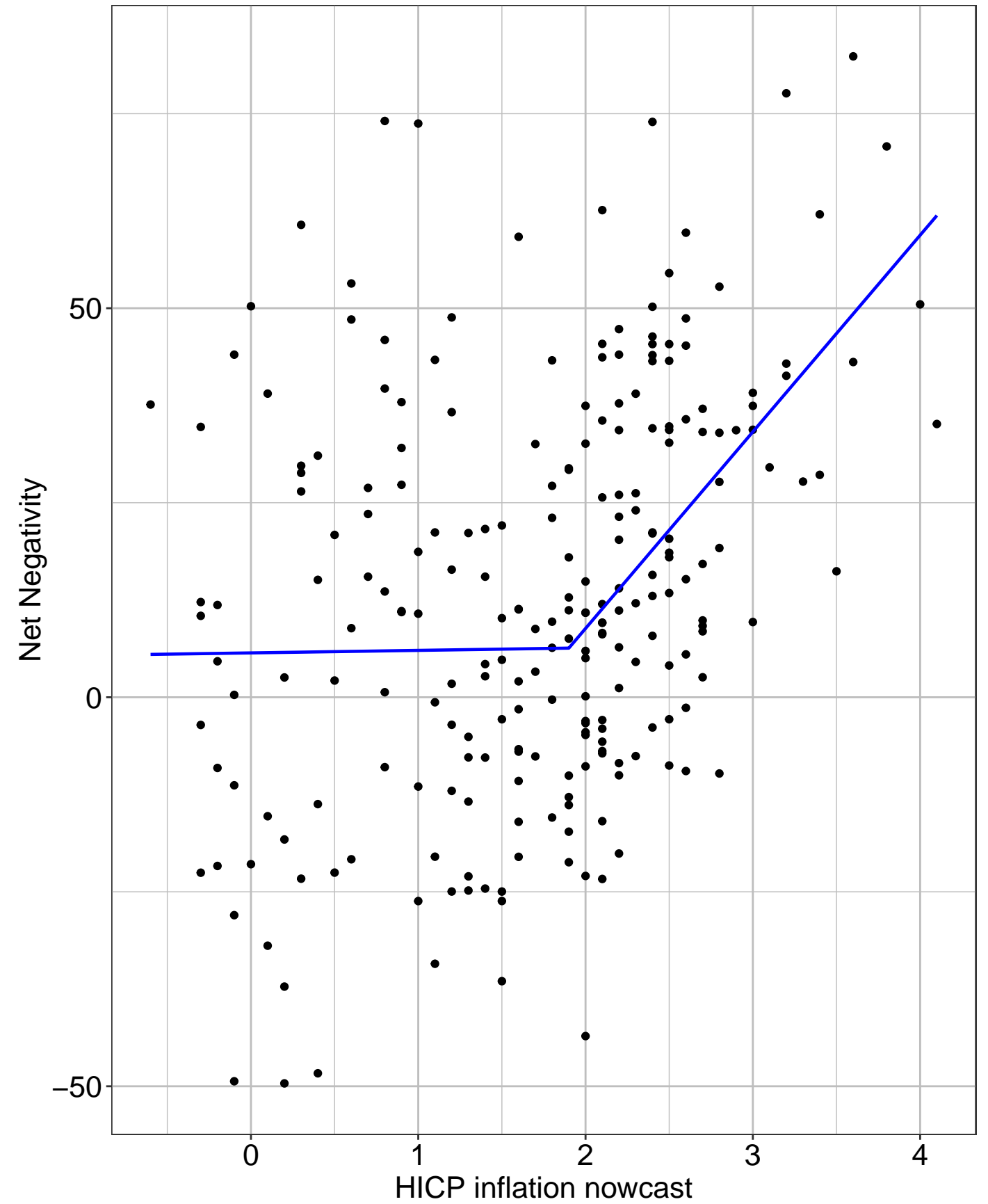
Asymmetric. Grid search over the estimated de facto inflation target